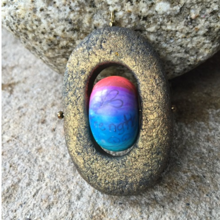
Spinning Wheel Pendants with Kathy Spignese