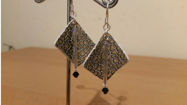
Window Canes with Gail Woods