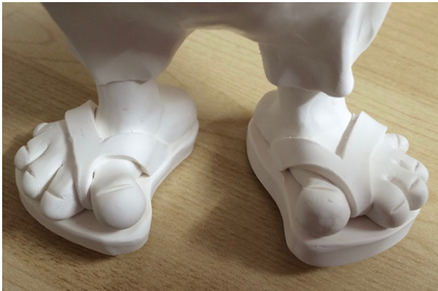
Stand up and Flip Flop with Mercedes Bantz

Learn to make feet with flip flops for character sculpting and how to use fishing weights for balance and ballast